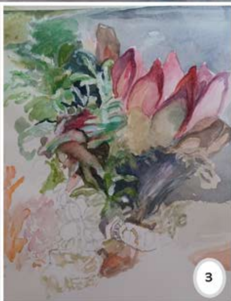
1. BROCKHAM VVILLAGE ( Sue Mikhalovicz ); 2. BLUE HUES ( Jenny Baker ); 3. FLORALIS ( Renate MacLennan )