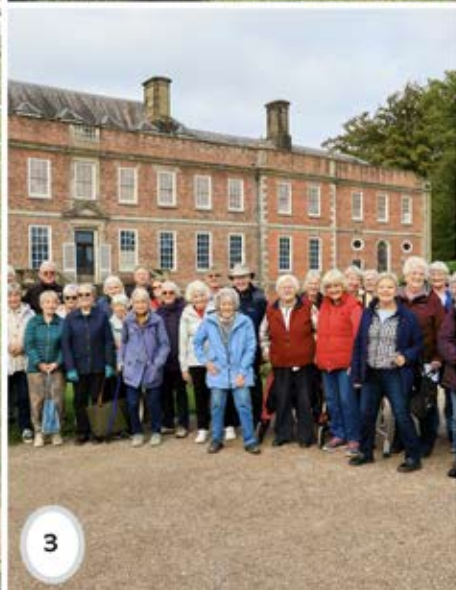
1. DUNHAM MASSEY HALL; 2. ALL ABOARD THE THOMAS TELFORD CANAL BOAT; 3. GROUP PHOTO AT ERDDIG; 4. RHS BRIDGEWATER GARDEN