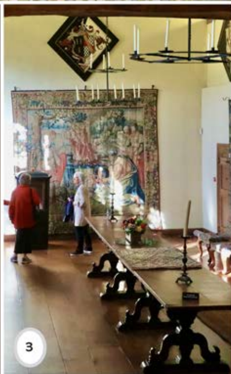
1. CHESTER HERITAGE TOUR WITH OUR GUIDE LIZ; 2. PACKWOOD HOUSE: STAINED GLASS WINDOWS ; 3. GREAT HALL WITH RICH TAPESTRIES; COVER PHOTO: STRATFORD-UPON-AVON