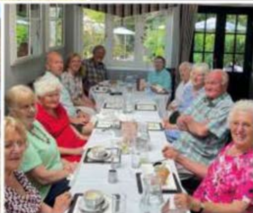
Top to bottom: BADMINTON AT ODDFELLOWS HALL; ROCK AND POP GROUP; GARDENING GROUP AND PLANT LOVERS; WALKING GROUP; SPRING QUIZ NIGHT; ARCHAEOLOGY GROUP; LUNCHEON CLUB AT THE GRUMPY MOLE