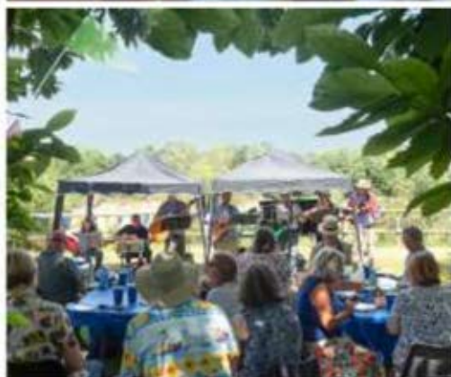
Clockwise: ARUNDEL WETLAND CENTRE; CHATHAM DOCKYARD MESS DECK; CHARLECOTE PARK SUTTON HOO, SUFFOLK RESIDENTIAL ; SUMMER PICNIC AT BUCKLAND LAKE PARK