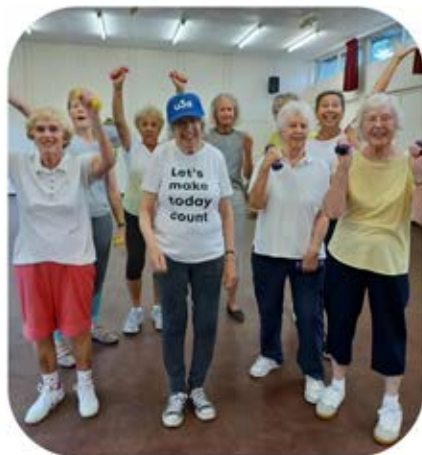
TOP LEFT: ART APPRECIATION AT THE LIGHTBOX, WOKING; ABOVE: CREATIVE WRITING; LEFT: EXERCISE FOR HEALTH; GUITAR GROUP