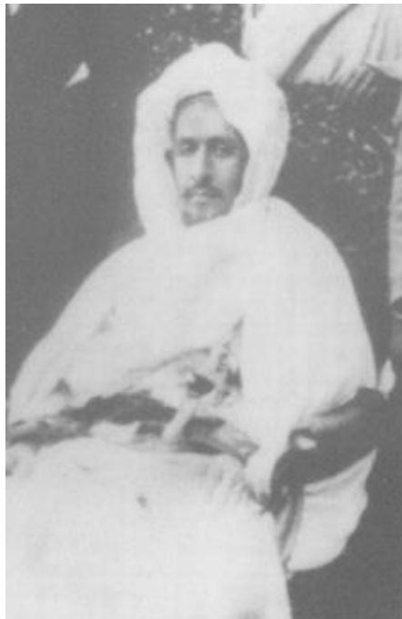
Al-Sayyid Ahmed al Sharif al-Sanusi aka Grand Sanusi

In September 1914 Sayyid Ahmad moved with the Sanusi to the Libyan side of the Egyptian border where the British colony began at Sollum. Camped with his army on the Libyan side two miles west of Sollum a year later were still there. Relations with British was good until spring 1915 when allies landed at Gallipoli, threatening Constantinople the seat of the Caliphate. The Italians, the Sanusi great enemy joined the world war on the side of the allies.