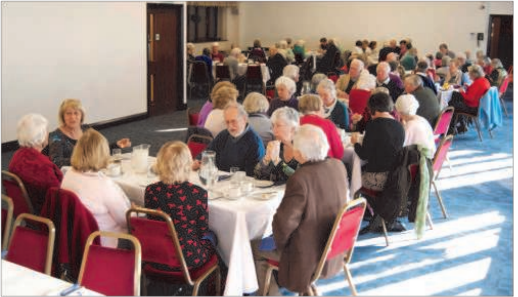
Top: Members at the tea party in Denbies